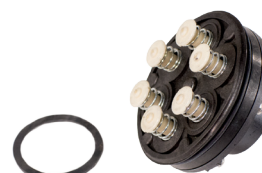
DEF Dura-Pump™ Cartridge KIT with O-Ring and Bottom Gasket DP-P4017A-D