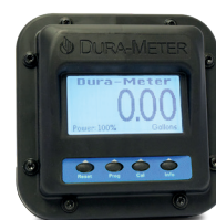
DEF Dura-Meter™ Face Plate DP-MFP01-D