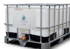
135-Gallon Tank DP-AG135