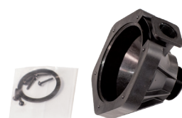
DEF Dura-Pump™ Bottom Housing KIT with Bottom Gasket and Screws DP-H4001A-E EPDM