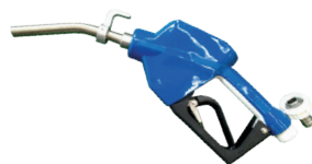
DEF Poly Auto Shut-Off Nozzle with Stainless Steel Spout and Swivel DP-N4005