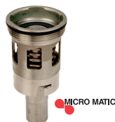
Stainless Steel RSV / 4 Key Container Valve 2.5" x 5" Buttress Thread DP-R4097-E EPDM