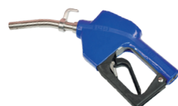
DEF Stainless Auto Shut-Off Nozzle with Stainless Steel Spout and Swivel DP-N4001