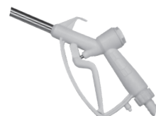
DEF POLY Manual Nozzle with Stainless Steel Spout and Poly Swivel DP-N4003