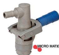
POLY RPV / 4 Key Dispense Coupler Barbed Liquid Outlet DP-R3714 EPDM