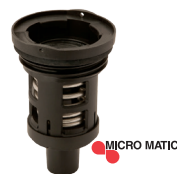
POLY RPV / 4 Key Container Valve 2.5" x 5" Buttress Thread DP-R2682 EPDM