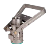
RSV / 3 Key Dispense Coupler, Viton Seals DP-R4003