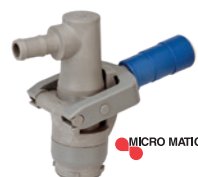
POLY RPV / 4 Key Dispense Coupler Barbed Liquid Outlet DP-R3714 EPDM