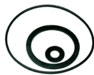
AG Dura-Pump™ Gasket Kit DP-G4001A-E EPDM DP-G4001A-V Viton® DP-G4001A-S Silicone