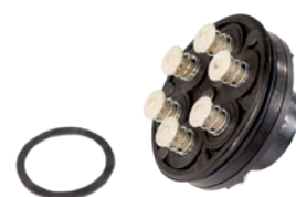
AG Dura-Pump™ Cartridge KIT with O-Ring and Bottom Gasket DP-P4017A-E EPDM DP-P4017A-V Viton® DP-P4017A-S Silicone