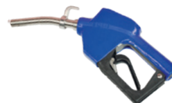
DEF Stainless Auto Shut-Off Nozzle with Stainless Steel Spout and Swivel DP-N4001