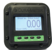
AG Dura-Meter™ Chemical Face Plate DP-MFP01