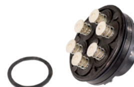
DEF Dura-Pump™ Cartridge KIT with O-Ring and Bottom Gasket DP-P4017A-D