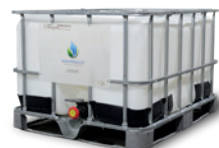
135-Gallon Tank DP-AG135