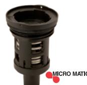
POLY RPV / 4 Key Container Valve 2.5" x 5" Buttress Thread DP-R2682 EPDM