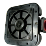
AG Dura-Meter™ Body DP-PMB3000E EPDM DP-PMB3000V Viton® DP-PMB3000S Silicone