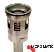
Stainless Steel RSV / 4 Key Container Valve 2.5" x 5" Buttress Thread DP-R4097-E EPDM